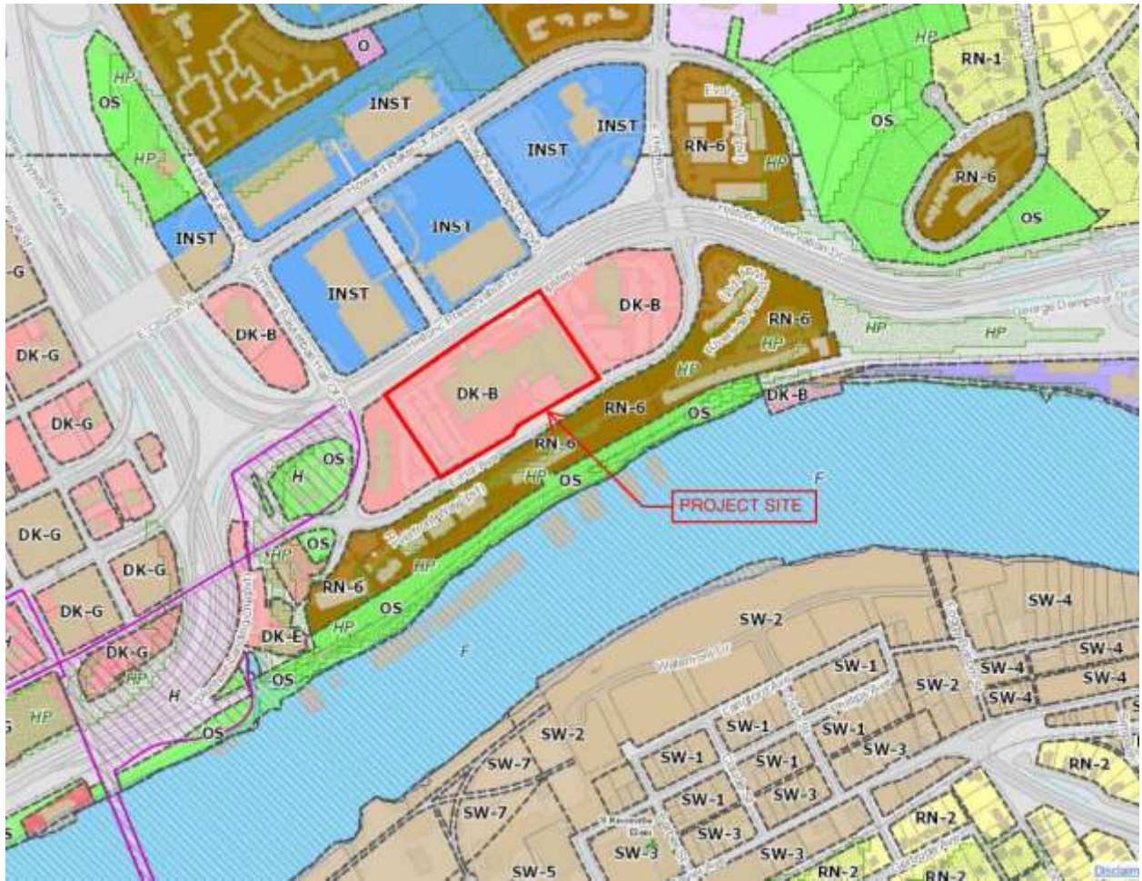
*Zoned DK-B: Downtown Knoxville Boulevards