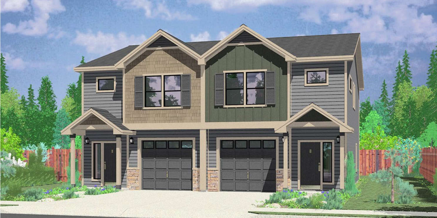
8-C-22-UR: Duplex Rendering