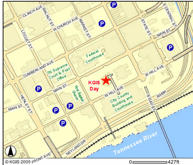
400 Main Street Small Assembly Room City/County Building

From north Knoxville - I-75 / I-275: Traveling South on I-75: take I-275 South; follow signs to US 441 South/Henley St; pass through the connector tunnel to Henley Street; go south to the third traffic light and turn left onto Main Street; go two blocks and the City/County building is located on the right side at 400 Main Street.